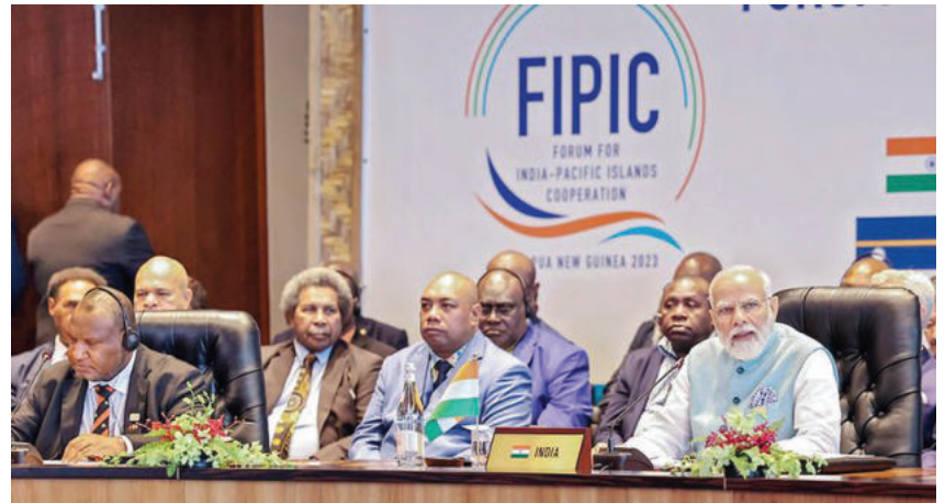
Prime Minister Narendra Modi delivers his opening remarks at the FIPIC summit at Port Moresby in Papua New Guinea on Monday.

Mr. Modi’s visit to Papua New Guinea highlights the growing strategic