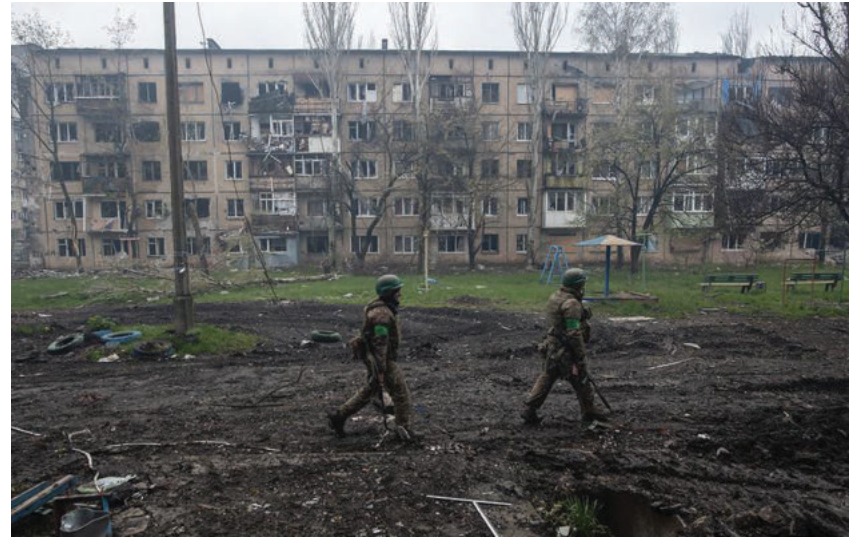
Last stand: Ukrainian soldiers walk in an area of the heaviest battles in Bakhmut in the Donetsk region of Ukraine.

Prigozhin said the mercenaries had set up "defence lines" on the western outskirts of the city before a planned transfer of control to the Russian army.