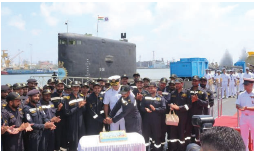
Crew aboard INS Sindhuratna in Mumbai after sailing for almost 10,000 miles with two port calls in between.