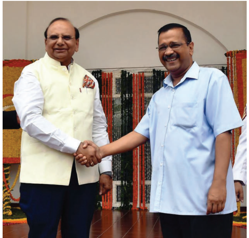
Constant tiff: The Lieutenant Governor of Delhi Vinai Kumar Saxena being greeted by Delhi Chief Minister Arvind Kejriwal in 2022. File Photo

The Ordinance is based on the argument that the Supreme Court has itself acknowledged the superior authority of Parliament to make laws for the national capital. A review petition filed by the Centre in the Supreme Court